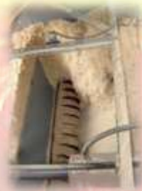
Turbine-generator unit type NETZ